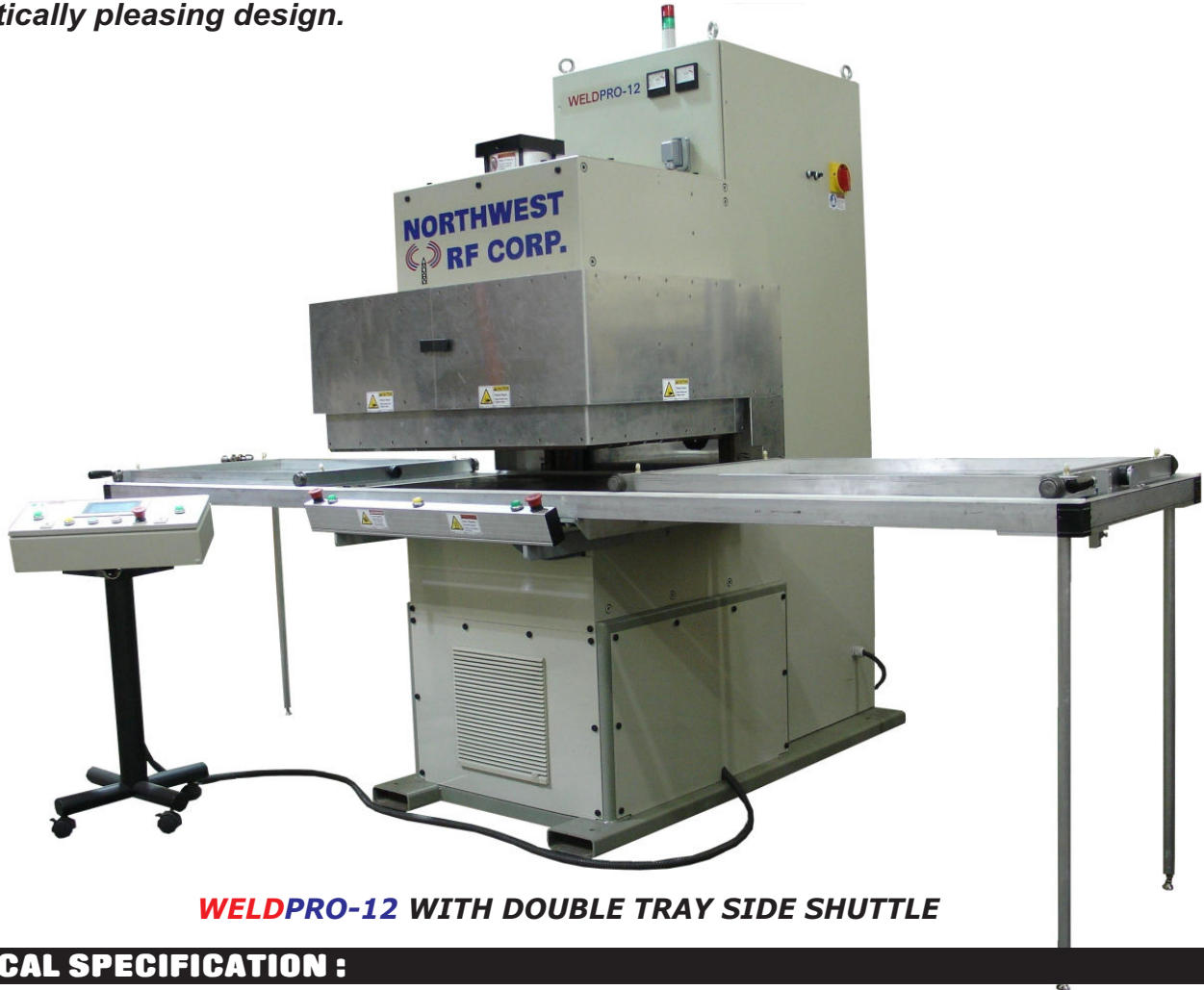
WELDPRO-12 WITH DOUBLE TRAY SIDE SHUTTLE

This technology allows for airproof, leakproof, high strength weld, in addition to an aesthetically pleasing design.